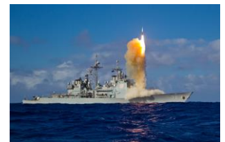
USS LAKE ERIE (CG 70)

"From the steel decks of my warships to your transportation needs ..... happy to serve!"