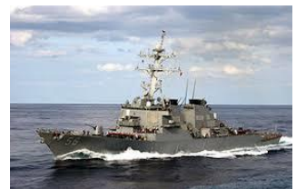
USS JOHN S. McCAIN (DDG 56)